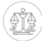
JUSTICE & LEGISLATION